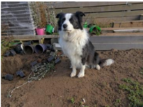
Helping Mum repot or un-pot.... Not sure why she was unhappy with me – I did such a good job with the yummy compost

The hardest thing for me and my brother and sister was not being able to leave the property for five whole long weeks – but Mum said it was for the best and we had to obey the rules set by the Government who look after us.