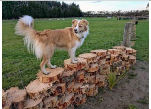
Rosie on what is going to be part of the dog fun wall in our new dog garden Mum is building.