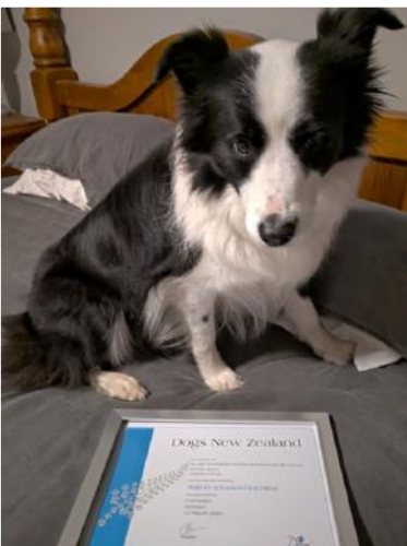
I really didn't want this picture taken. I thought Mum would get the message when I ran away to the bedroom.... She followed me and here I am with my RallyO RAE Certificate.